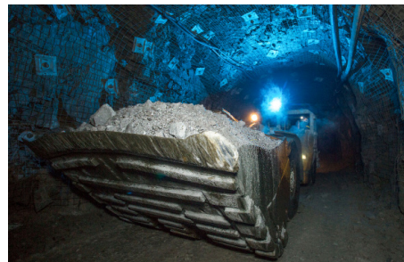
Enables tele-operation of an LHD between shifts and autonomous control from the muck pile to the ore pass