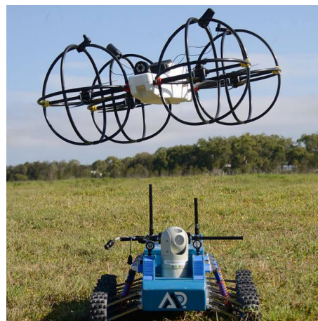
Australian Droid + Robot's Explora droids for underground inspections has Rajant's BreadCrumb technology integrated

An example is the Explora underground mapping and inspection robot by Australian Droid + Robot, which has Rajant's BreadCrumb technology onboard—enabling its ability to independently perform visual inspections, thermal imaging, laser survey scanning, gas sensing, and other tasks to identify and or operate in hazardous mine conditions. Rajant's network also uniquely enables these autonomous systems to communicate vehicle to vehicle to create an autonomous mesh network to manage their movements throughout the mine.